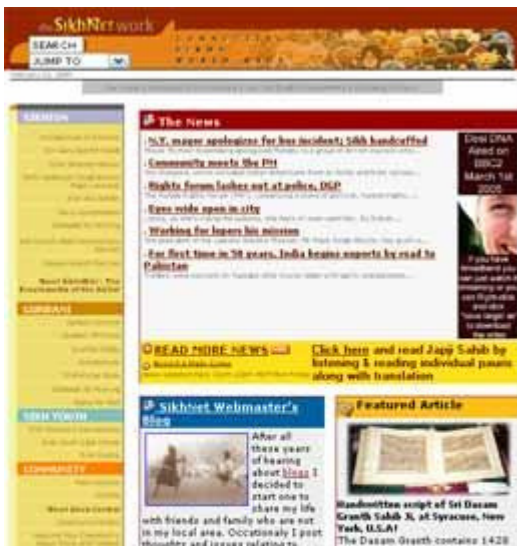
Old SikhNet Design